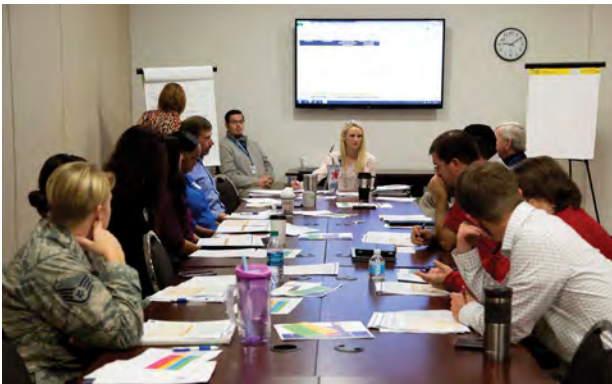
Local Public Health System Assessment (LPHSA)