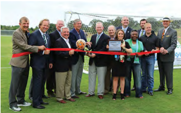
Community Sports Fields Ribbon Cutting