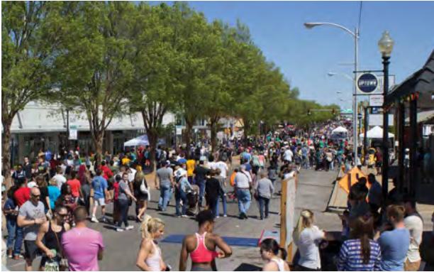
Open Streets Event